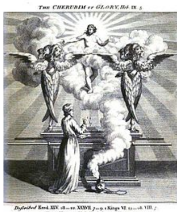
Depiction of the "cherubim of glory shadowing the mercy seat" (Julius Bate, 1773)

2 Chronicles 3:11 The wingspan of the cherubim was twenty cubits; the wing of one, of five cubits, touched the wall of the house, and its other wing, of five cubits, touched the wing of the other cherub.