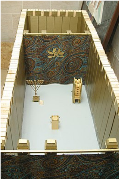
A model of the Tabernacle showing the holy place, and behind it the Holy of Holies

Now he made the room of the holy of holies: its length across the width of the house was twenty cubits, and its width was twenty cubits; and he overlaid it with fine gold, amounting to 600 talents.