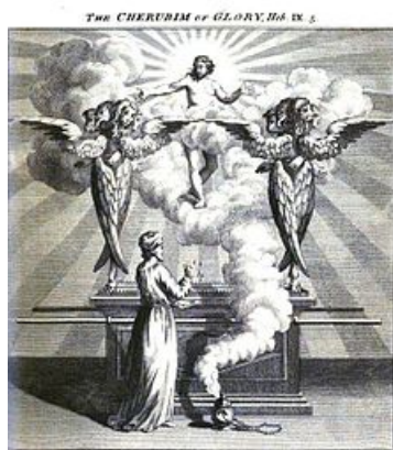
Depiction of the "cherubim of glory shadowing the mercy seat " (Julius Bate, 1773)

2 Chronicles 3:11 The wingspan of the cherubim was twenty cubits; the wing of one, of five cubits, touched the wall of the house, and its other wing, of five cubits, touched the wing of the other cherub.