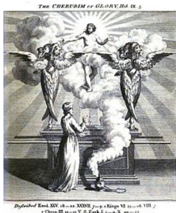
Depiction of the "cherubim of glory shadowing the mercy seat" (Julius Bate, 1773)

2 Chronicles 3:11 The wingspan of the cherubim was twenty cubits; the wing of one, of five cubits, touched the wall of the house, and its other wing, of five cubits, touched the wing of the other cherub.