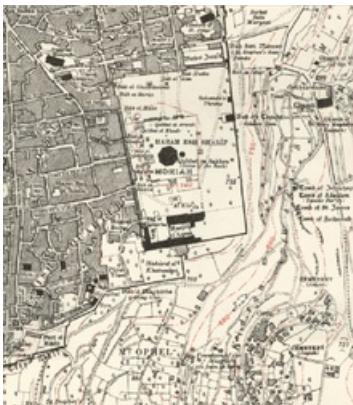
Map of Jerusalem in 1925, showing the location of Mount Moriah according to Jewish sources (CLICK TO ENLARGE)

INTRODUCTION - Raymond Dillard: In light of the dominant role the temple plays in the Chronicler's history the most striking feature of his account of the building of the temple is its brevity: forty-six verses in Kings (1 Kgs 6:1–38; 7:15–22) compared to seventeen in Chronicles. Much of the extensive detail regarding the architecture of the temple is omitted (2 Ch 6:4–19, 22, 26, 29–38; 7:15, 17b–20, 22), along with the description of Solomon's palace (2Ch 7:1–12). The Chronicler adds only a few details not found in the parallel text (2Ch 3:1, 6, 8b–9, 14). At the very least the author is depending on the reader's knowledge of the account in Kings, for without that information his description of the temple is relatively opaque.